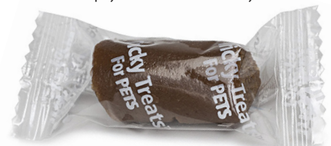
Actual Size: Two Tricky Treats wrapped for individualized dosing and dispensing